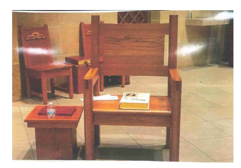
What am I and where am I located?