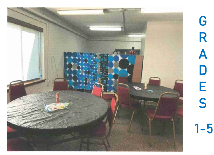
Where am I this week?